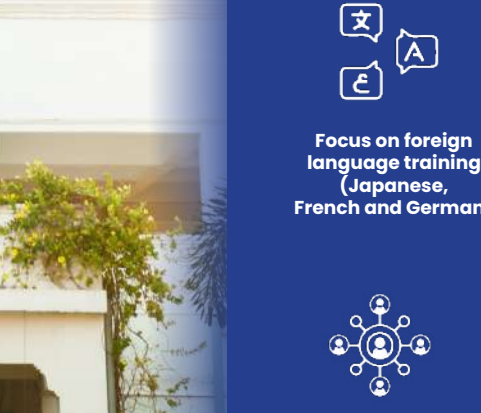
Active Involvement Society Endeavors